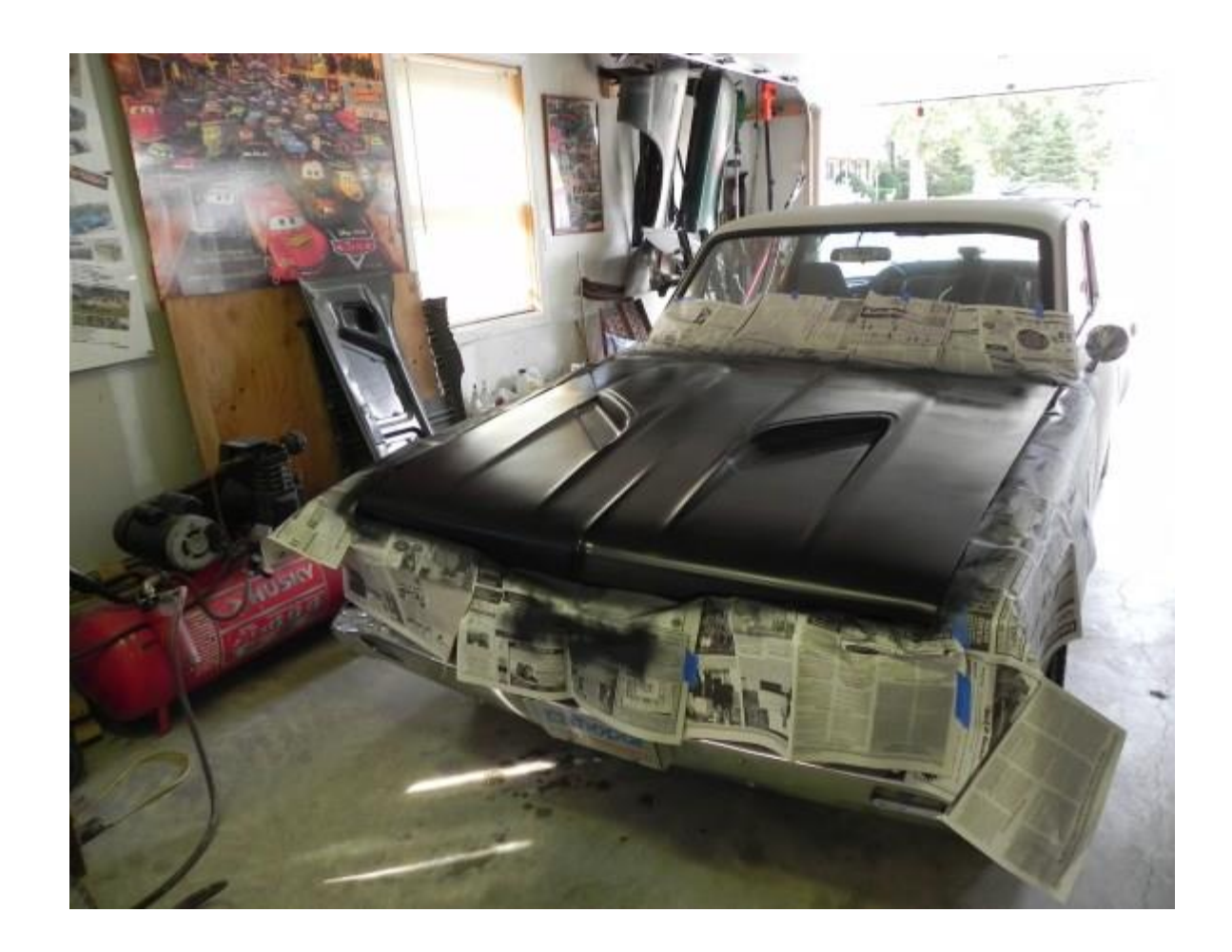
....and there you have it.